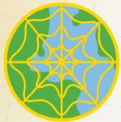
Global Leadership Advisory Group