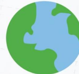
International Business Forum