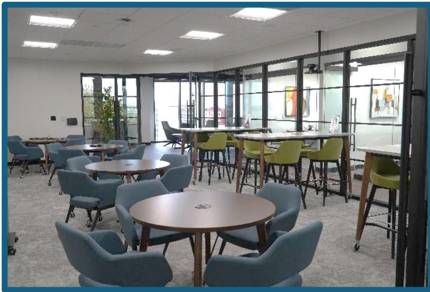
Classroom space with glass walls and fits 35 members