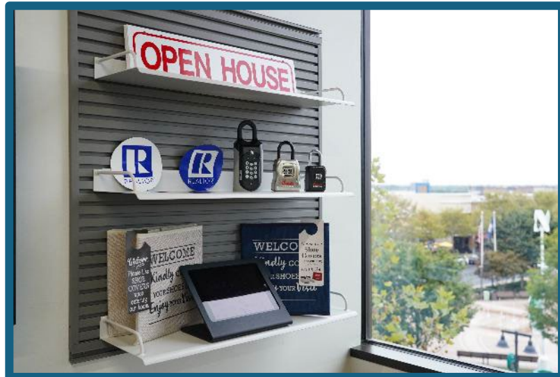
Realtor® items displayed (available for purchase)