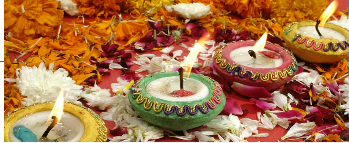
Diwali is the Indian festival of lights.

#1 Export: 10% Mineral fuels, mineral oils & products of their distillation