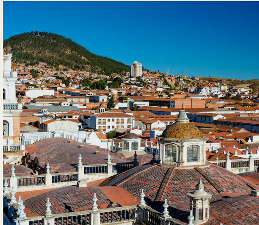
Bolivia's highest courts are located in the city of Sucre, the country's second capital.

Official Name: Plurinational State of Bolivia Form of Government: Republic Capital: La Paz, Sucre Population: 11,306,341 Official Language: Spanish & 36 indigenous languages Currency: Bolivian Boliviano Area: 424,164 square miles (1,098,581 square kilometers) #1 Export: 28% Mineral fuels, mineral oils & products of their distillation