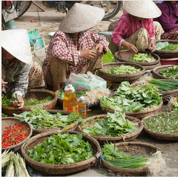
Vendors sit by their goods at a market in Vietnam.