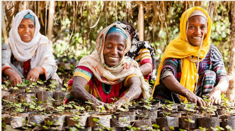
More than 1,000 women are working in nurseries across southwestern Ethiopia to produce high-quality coffee seedlings.