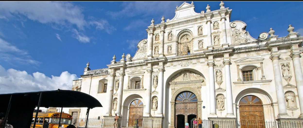
The Cathedral de Santiago in the town of Antigua, Guatemala was built around 1543.