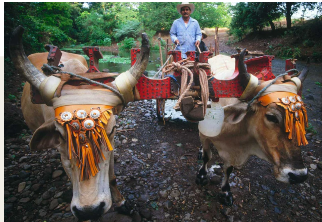
A man drives an ox cart along a road in El Salvador.

FUN FACT: "El Monumento al Divino Salvador del Mundo" was built in 1942!