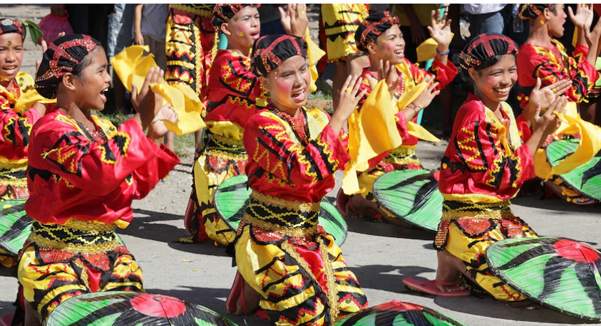
A dance group performs at the annual Lanzones Festival