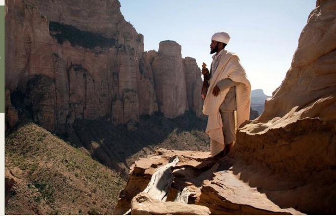
A priest stands on the edge of a cliff in front of the entrance to Ethiopian Orthodox rock-hewn church of Abuna Yemata Guh in the Gheralta Cluster in the Tigray mountains in Megab, Ethiopia.