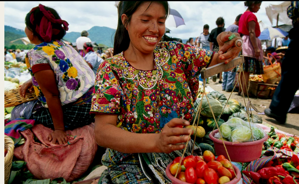
Vendors sell food and other goods in an open-air market in Guatemala.