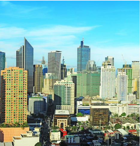
Manila, the capital of the Philippines.

#1 Export: 50% Electrical machinery & equipment; sound recorders & reproducers, television image equipment