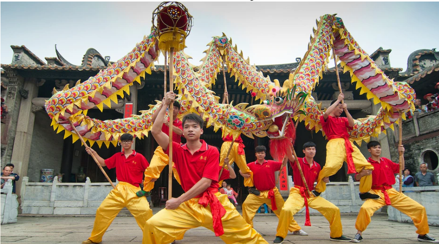
Dragon dances have been performed in China for over 2,000 years and are believed to bring about good fortune.