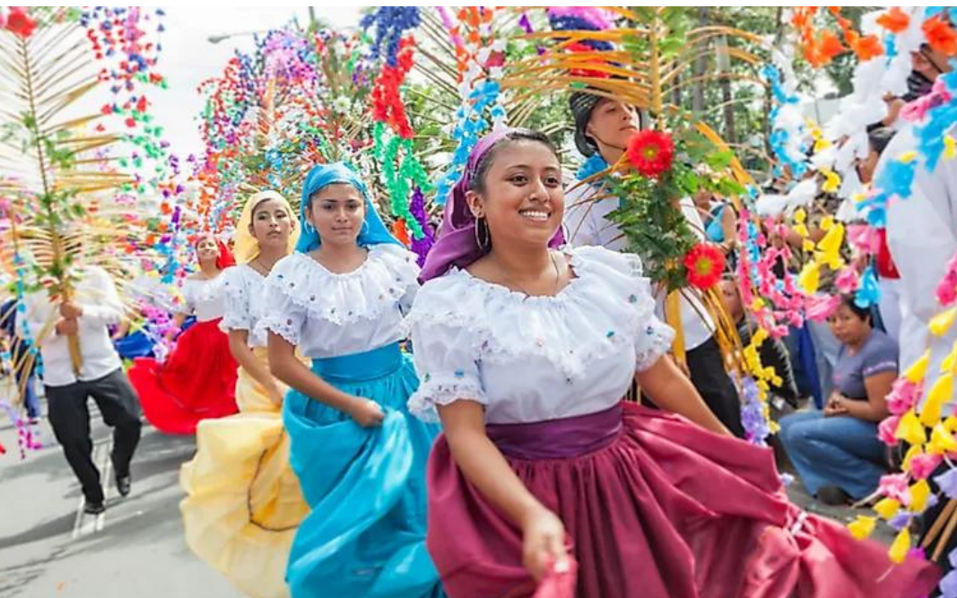
Participants in the Independence Day Parade in San Salvador, El Salvador.