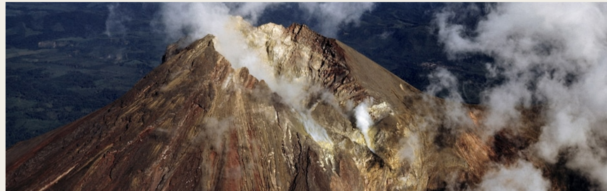
Smoke swirls around one of Guatemala's many volcanoes