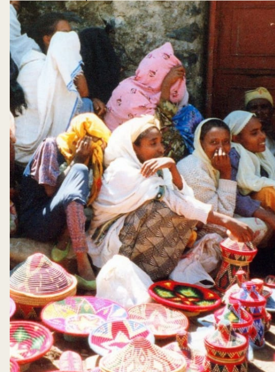
There are more than 80 different ethnic groups in Ethiopia & over 200 dialects are spoken.