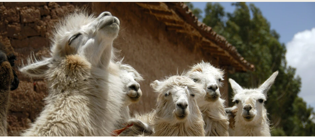
In Peru, llamas have been used as pack animals for centuries.