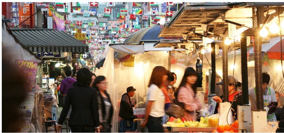
Shoppers crowd an outdoor market in South Korea.