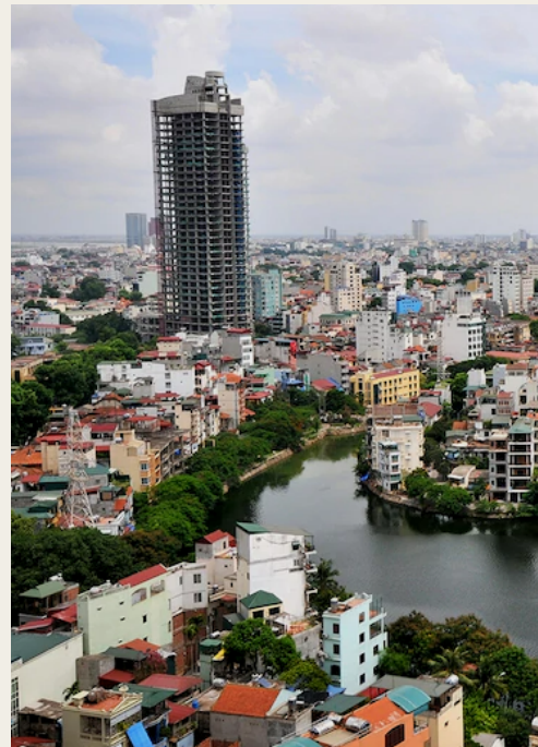
Hanoi is Vietnam's capital city.

Approximately, 50,000 people in Northern VA speak Vietnamese.