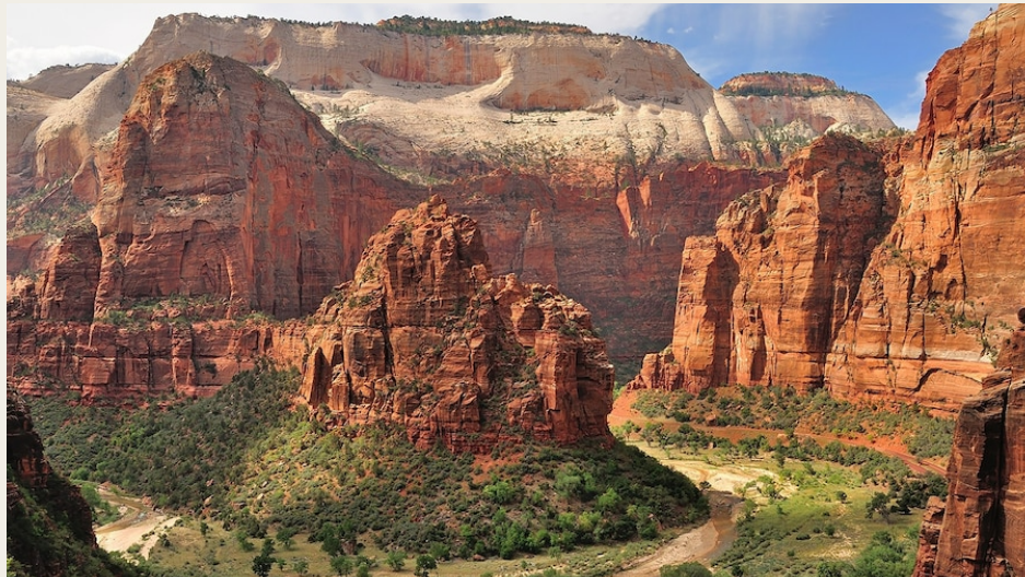
Zion Canyon is a gorge in southwestern Utah.