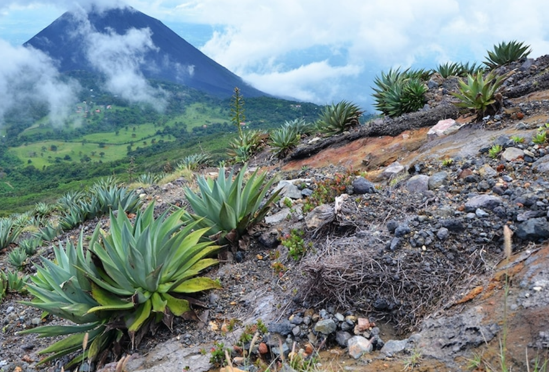
Known as the "land of volcanoes," El Salvador has frequent earthquakes and volcanic activity.