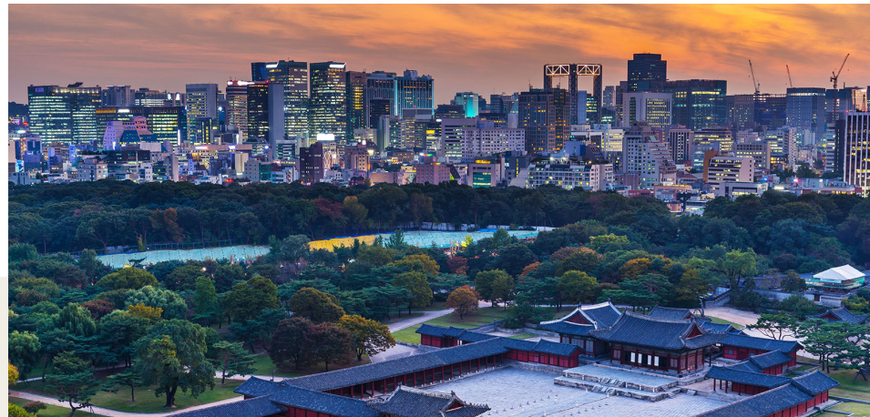
Ch'anggyŏng (Changgyeong) Palace, with downtown Seoul in the background.