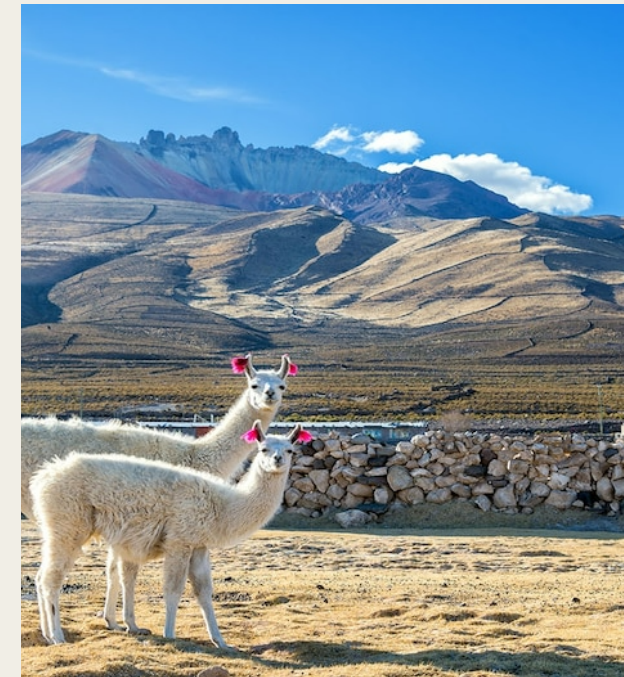
The llama is the national animal of Bolivia.