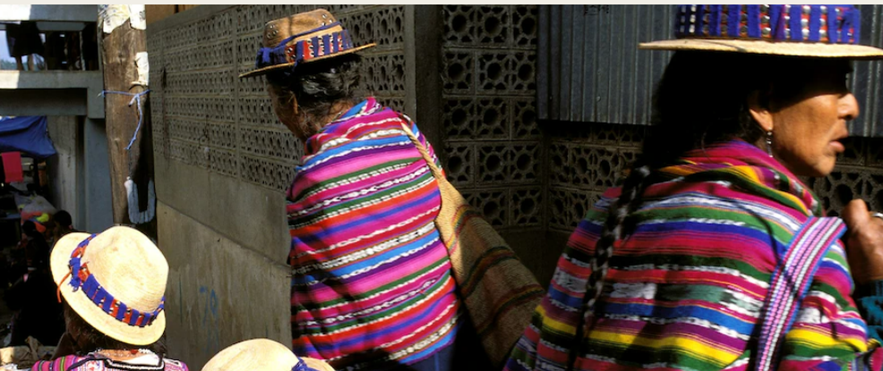
Mayan traditional dress in Guatemala includes brightly woven clothing.