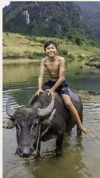
Most Vietnamese people live in the countryside, mainly in the river delta regions of the north & south.