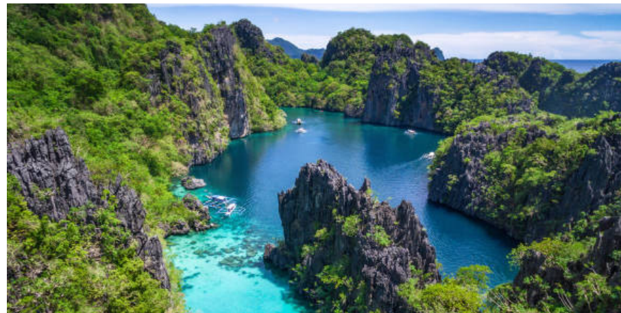
One of the many islands that make up the Philippines