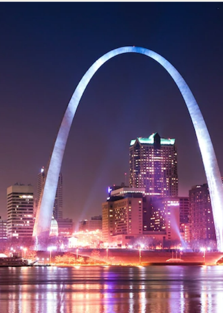
The Gateway Arch in St. Louis, Missouri, is the tallest monument in the United States.