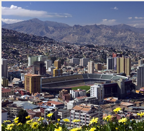
La Paz is one of Bolivia's two capital cities. The official residence of Bolivia's president is located here.