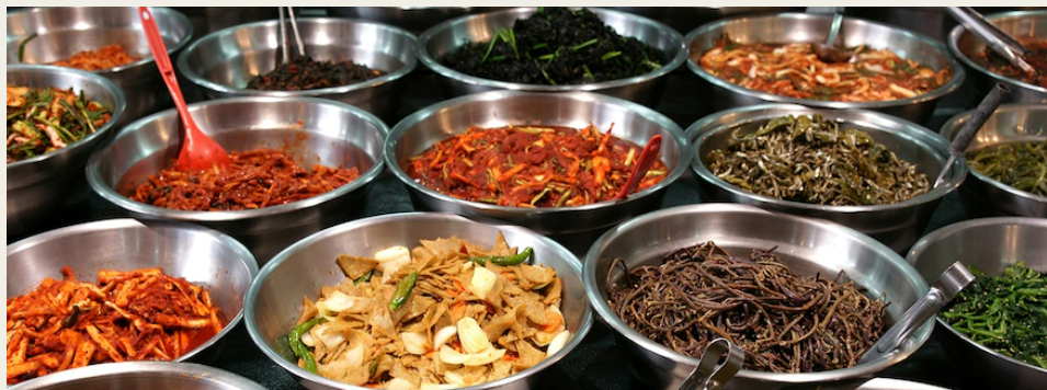
A market sells food in South Korea.