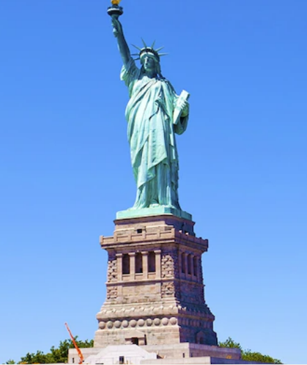
The Statue of Liberty in New York was a gift from France to the United States.