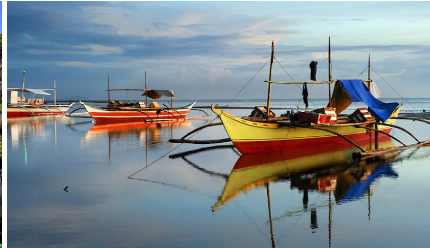
Only about one third of the islands of the Philippines are inhabited.