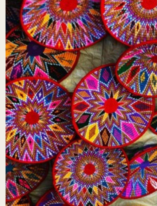
Ethiopian Habesha baskets