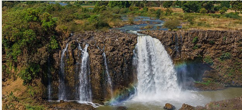
Blue Nile River is known as Abbay in the local language. This river contributes up to 80% of the Nile River's flow.