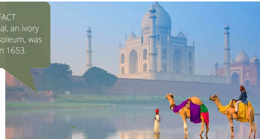
Taj Mahal, India

The Taj Mahal, an ivory marble mausoleum, was finished in 1653.