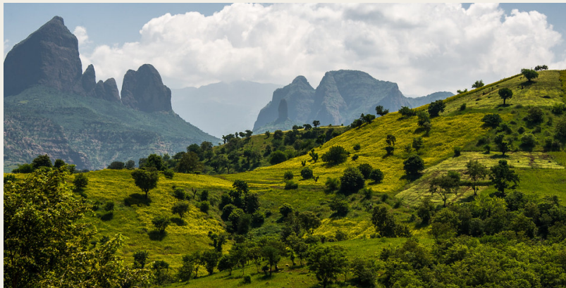
Simien Mountains National Park is in northern Ethiopia.