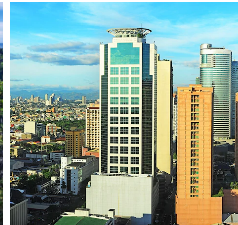
Manila, the capital of the Philippines.