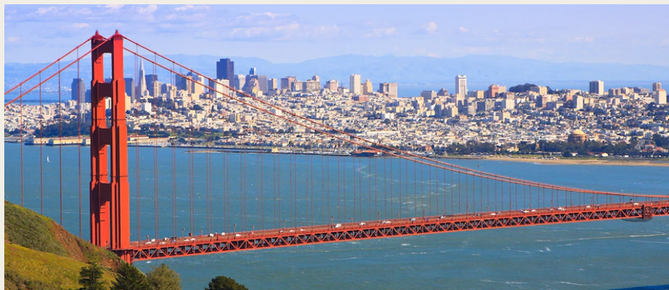
The Golden Gate Bridge spans more than a mile in San Francisco, California.