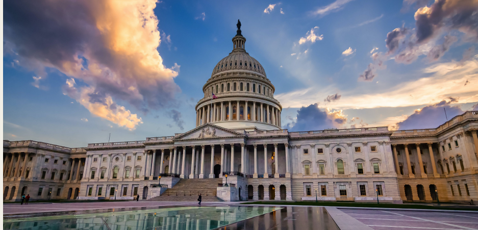
Washington, D.C., US Capitol. A symbol of the American people & their government, the meeting place of the nation's legislature. Musement.com