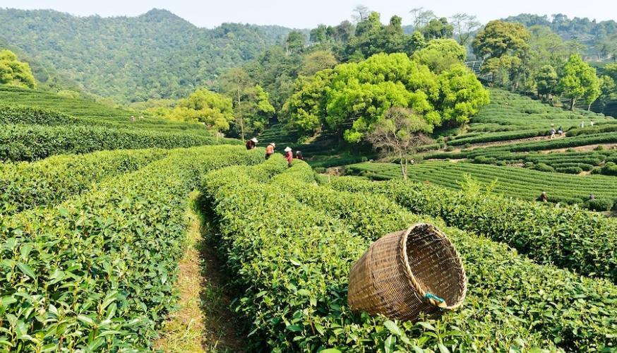
Dragon well green tea, or Longjing, is grown in the city of Hangzhou, China.