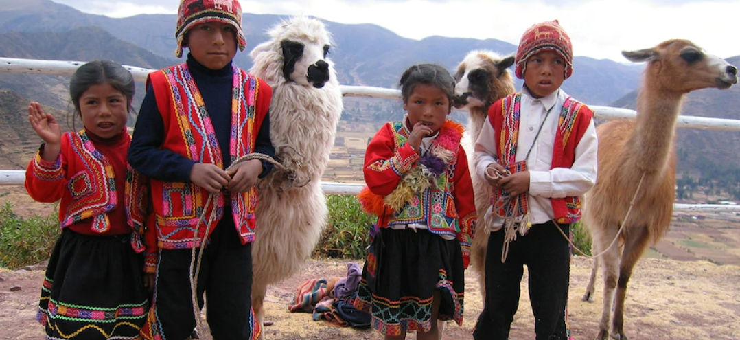
Children wear traditional Peruvian clothing.