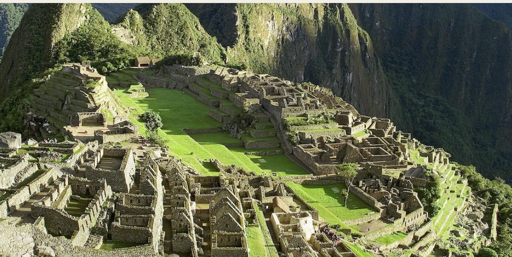
The ancient city of Machu Picchu was built by the Inca.