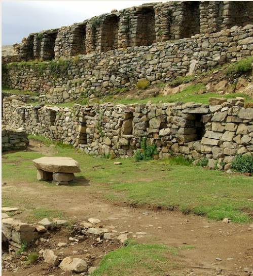
The Inca people thrived between the 12th and 16th centuries.

Official Name: Plurinational State of Bolivia Form of Government: Republic Capital: La Paz, Sucre Population: 11,306,341 Official Language: Spanish & 36 indigenous languages Currency: Bolivian Boliviano Area: 424,164 square miles (1,098,581 square kilometers) #1 Export: 28% Mineral fuels, mineral oils & products of their distillation