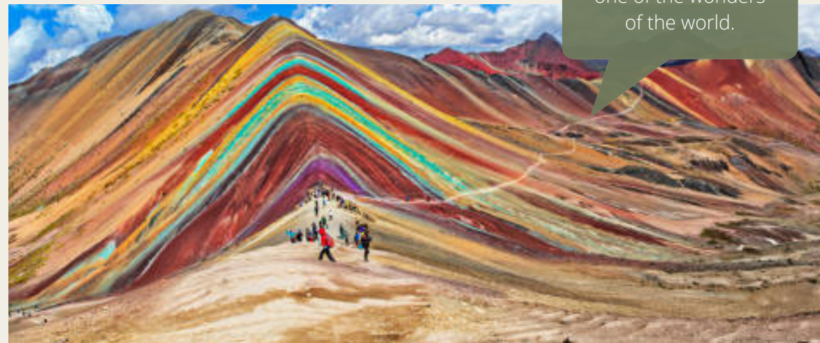
Vinicunca/Winikunka, also called Montaña de Siete Colores , Montaña de Colores or Rainbow Mountain, is a mountain in the Andes of Peru.

FUN FACT: The Incan mystery is one of the wonders of the world.