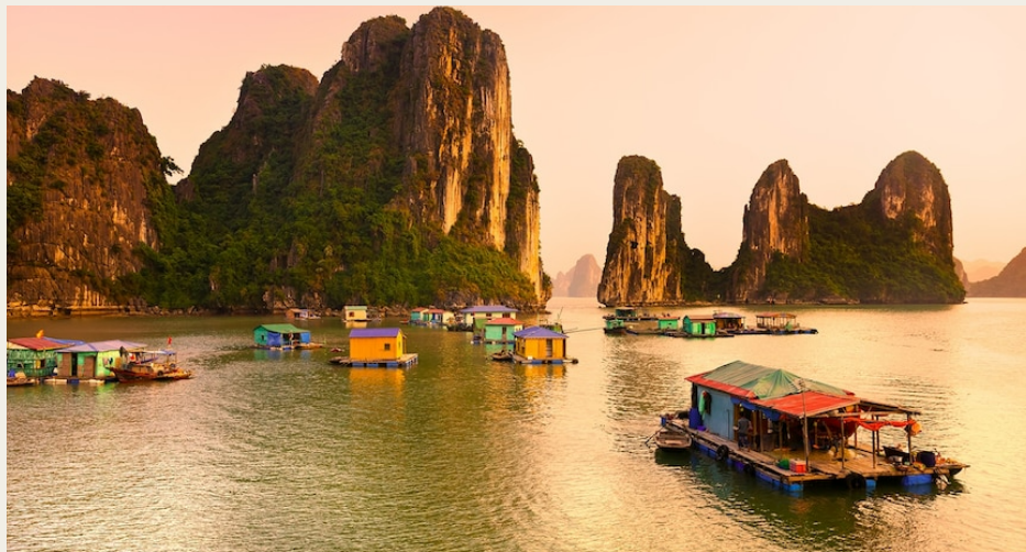
Ha Long Bay in northeast Vietnam consists of more than 1,600 islands & inlets.