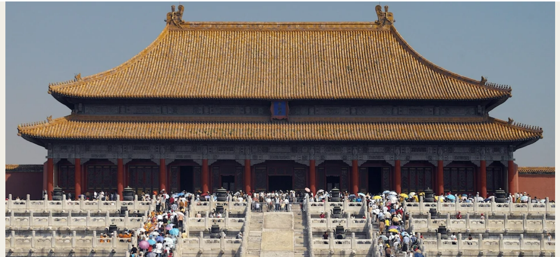
The Forbidden City holds the Palace Museum and is in the center of Beijing.

#1 Export: 26% Electrical machinery & equipment; sound recorders & reproducers, television image equipment