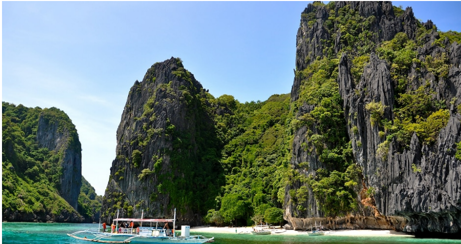
The Batad Rice Terraces & the Bangaan Rice Terraces are protected UNESCO World Heritage sites. Banaue, Philippines.