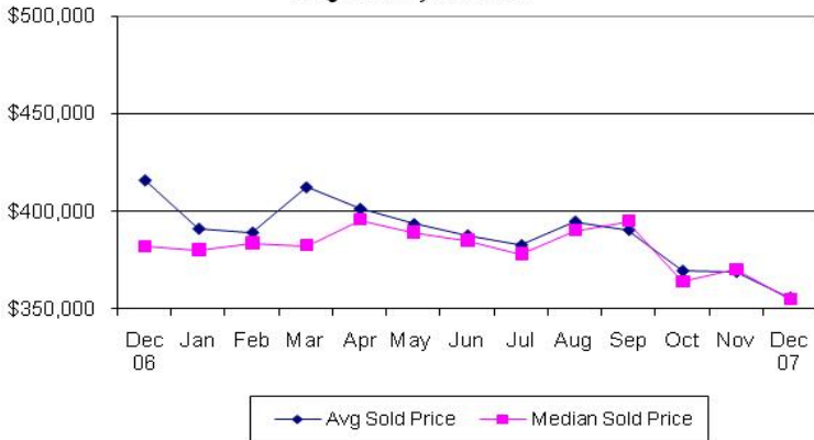
Average and Median Sold Price Loudoun County Single-Family Attached