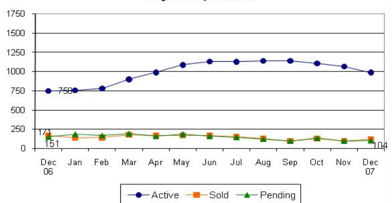
Units Sold, Pending Contracts and Active Listings Loudoun County Single-Family Attached