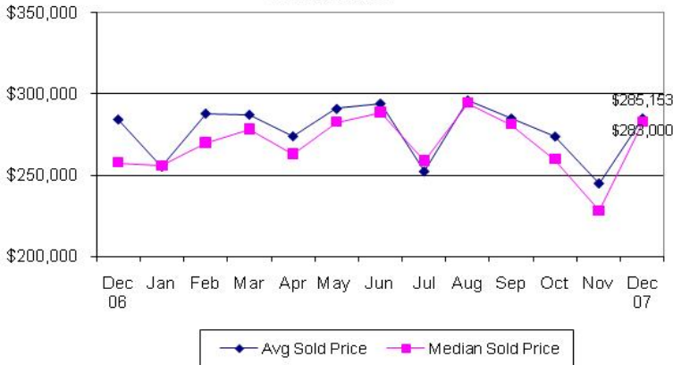
Average and Median Sold Price Loudoun County Condominiums