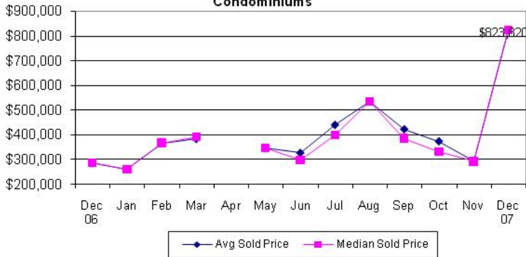
Average and Median Sold Price City of Falls Church Condominiums